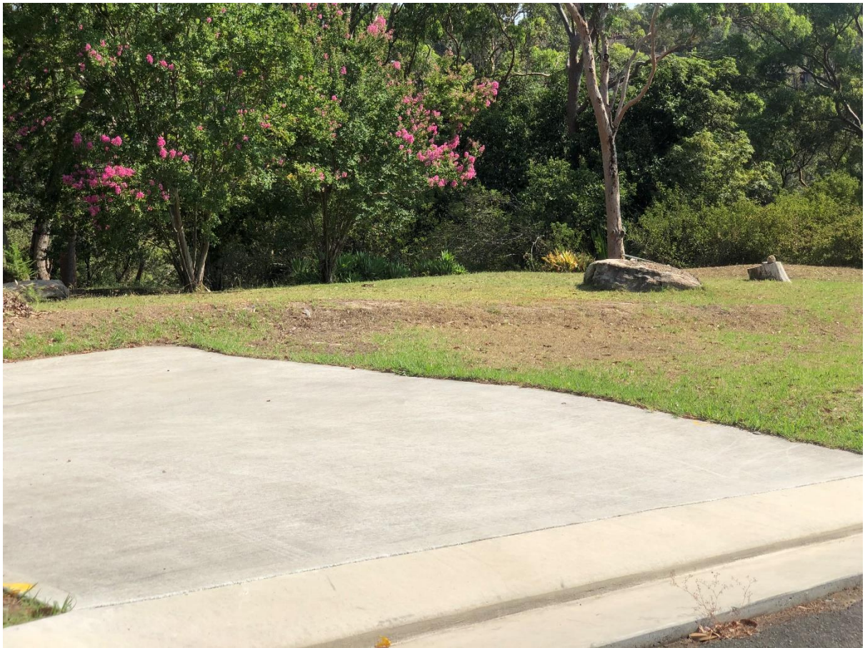
Photo 24 – part E4 zoned parcel (driveway approved under previous golf course subdivision)