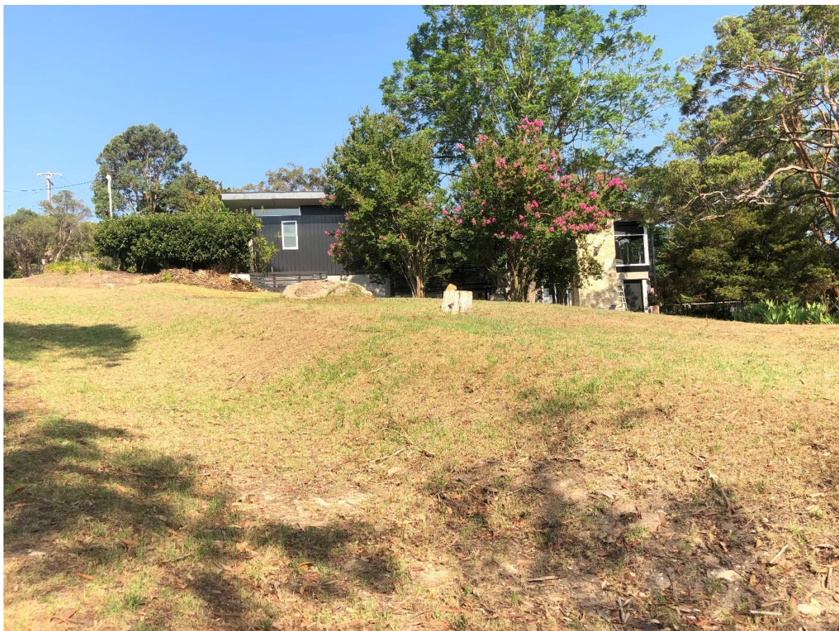
Photo 23 – View to eastern boundary (No 126 Beaconsfield Road – overlooks E4 parcel)