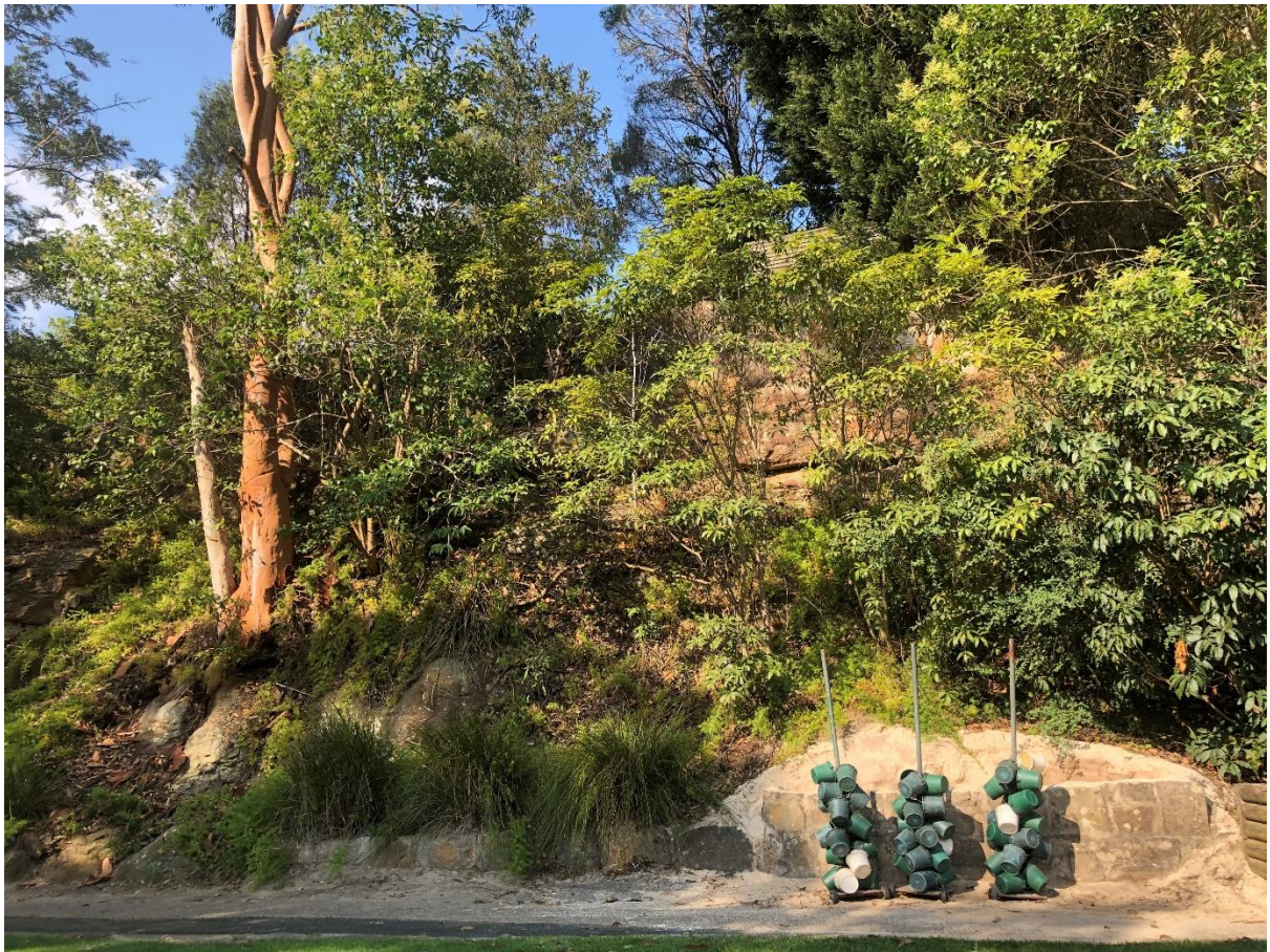
Photo 38 – View of southern end of E4 parcel abutting golf course fairway (proposed APZ)