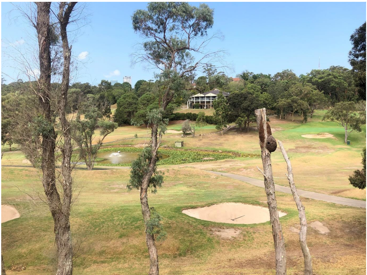
Photo 2 – View from fairway looking east to Clubhouse and subject site