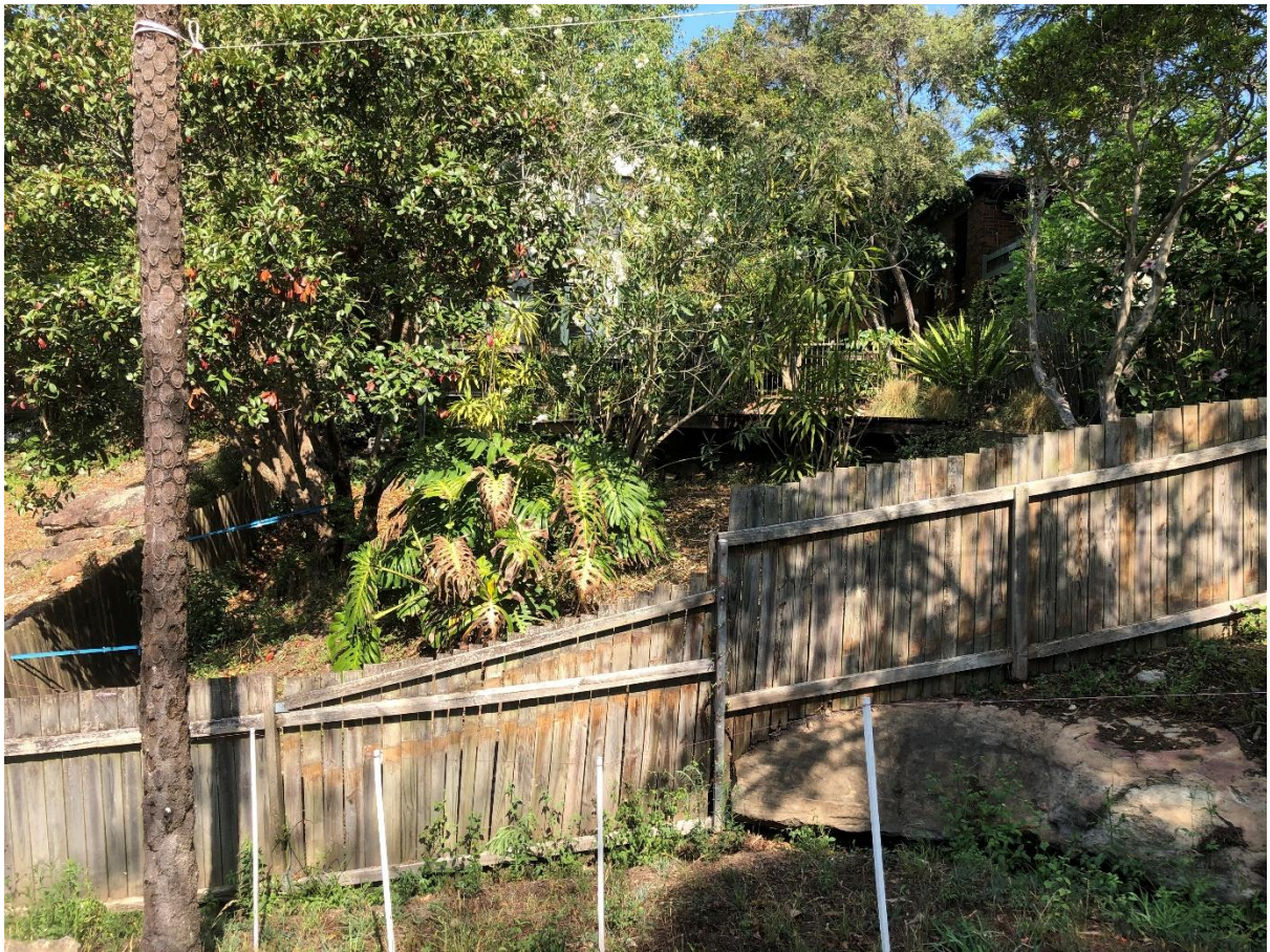
Photo 15 – View to eastern boundary (rear yard No 17 Colwell Crescent)