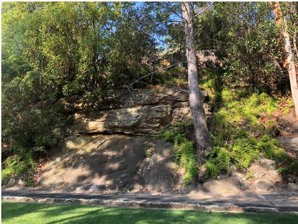
Photo 35 – View of southern end of development site (proposed APZ)