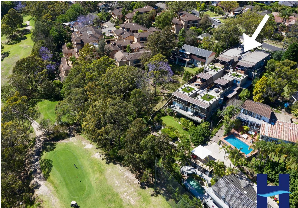
Photo 45 – Units overlooking south side of fairway No 13 Hart Street