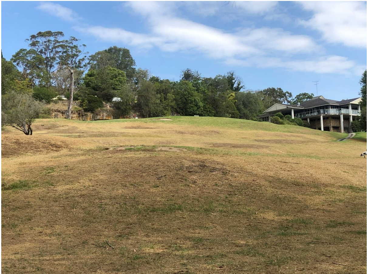
Photo 6 – View from fairway looking south-east to Clubhouse & carpark site