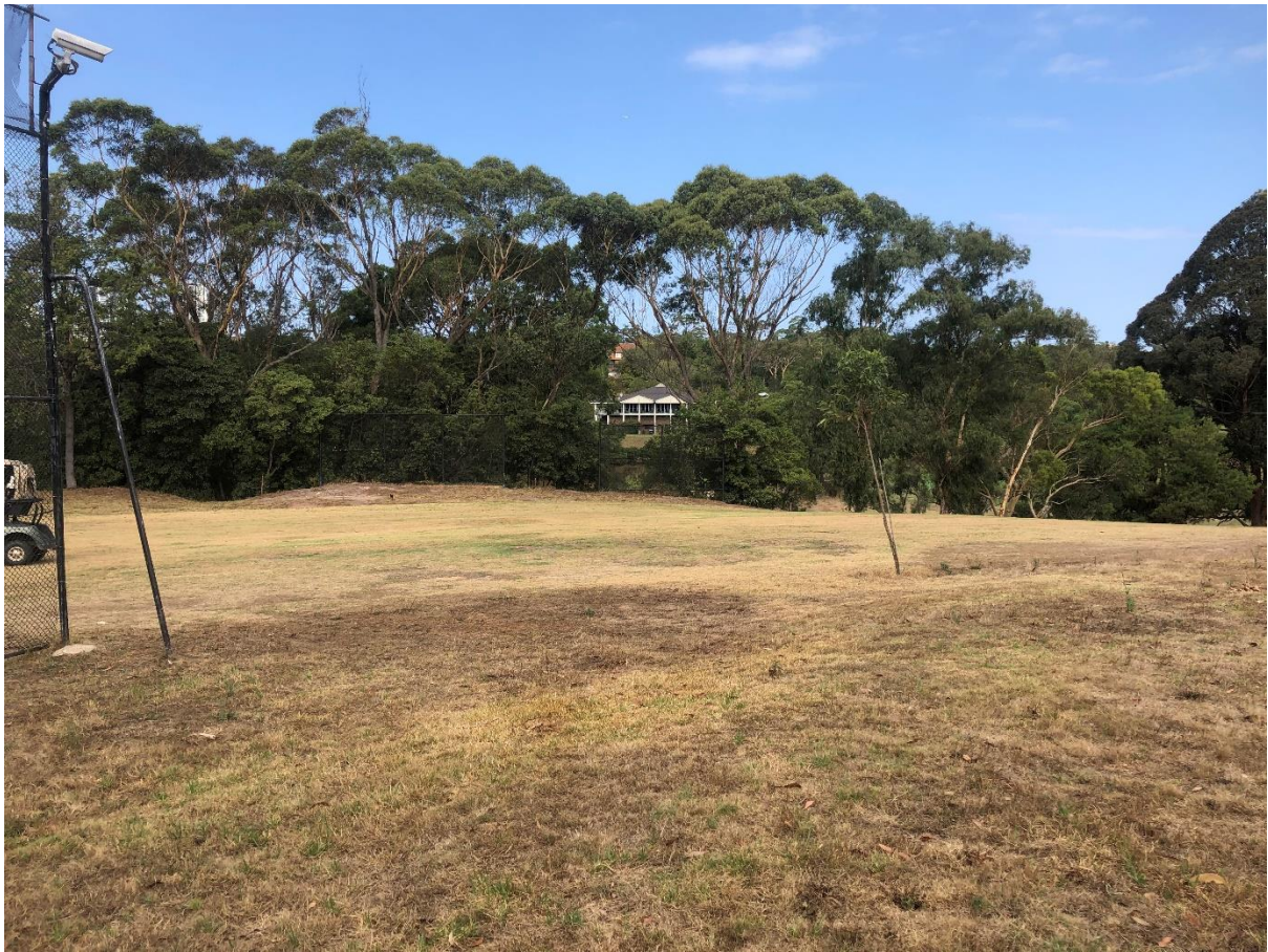
Photo 3 – View from fairway (near Mooney Street houses) looking east to Clubhouse site