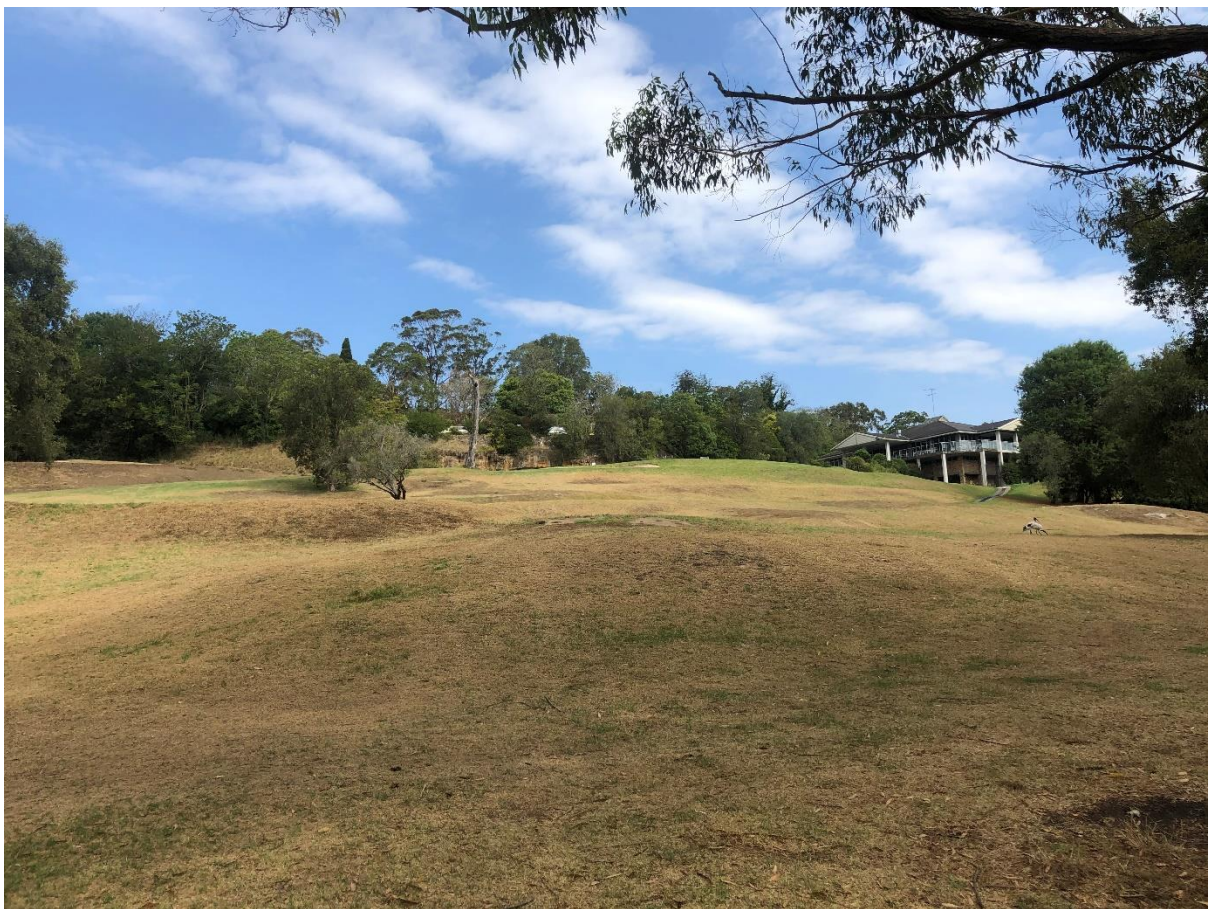
Photo 5 – View from mid-way across fairway looking south to Clubhouse site