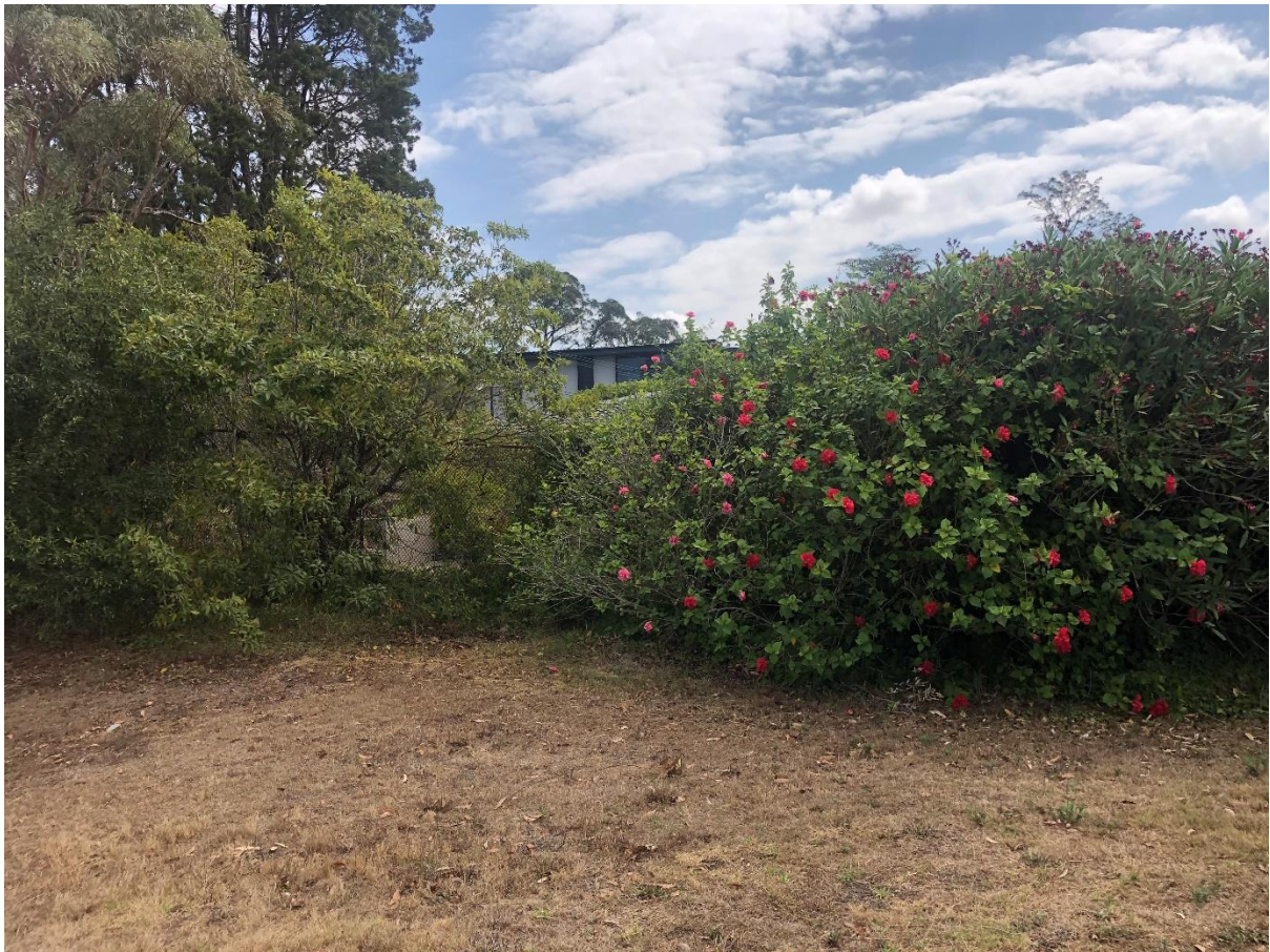
Photo 3b – View of Mooney Street house overlooking golf course and facing Clubhouse site