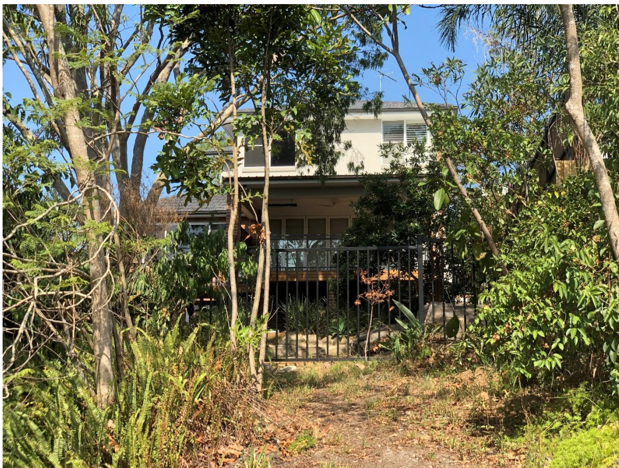
Photo 18 – View to eastern boundary (rear yard No 23 Colwell Crescent)