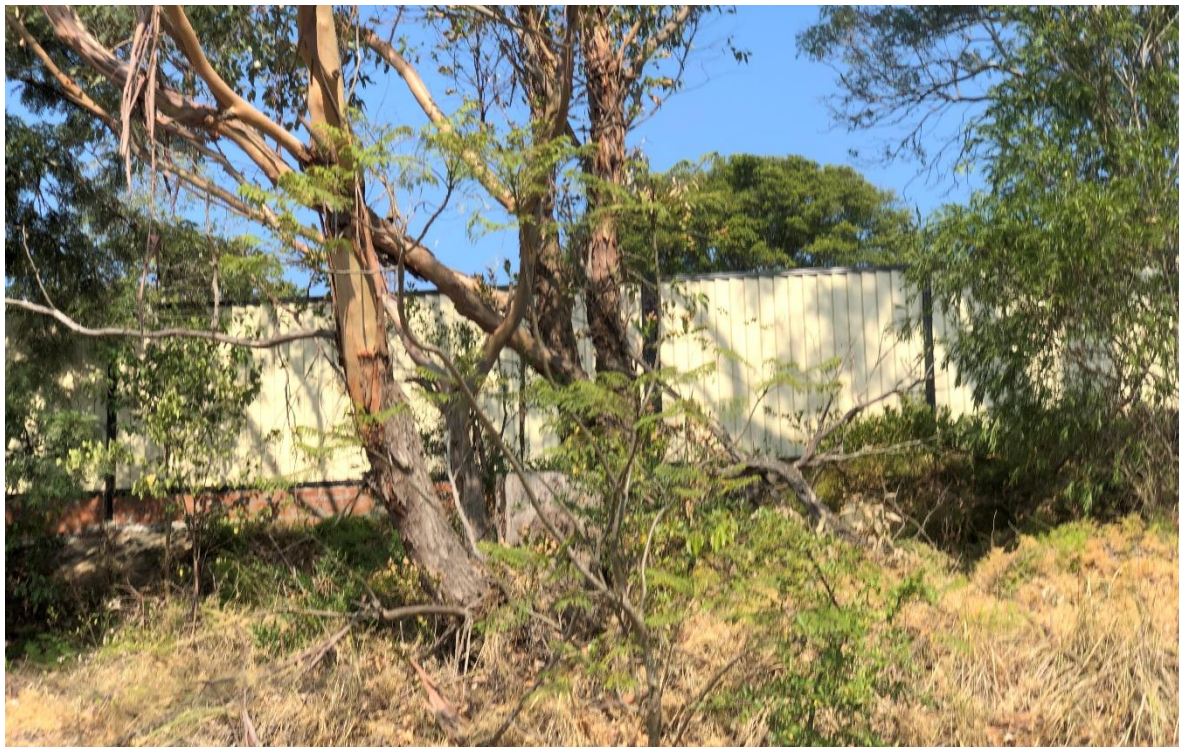
Photo 20 – View to eastern boundary fence (No 27 Colwell Crescent)