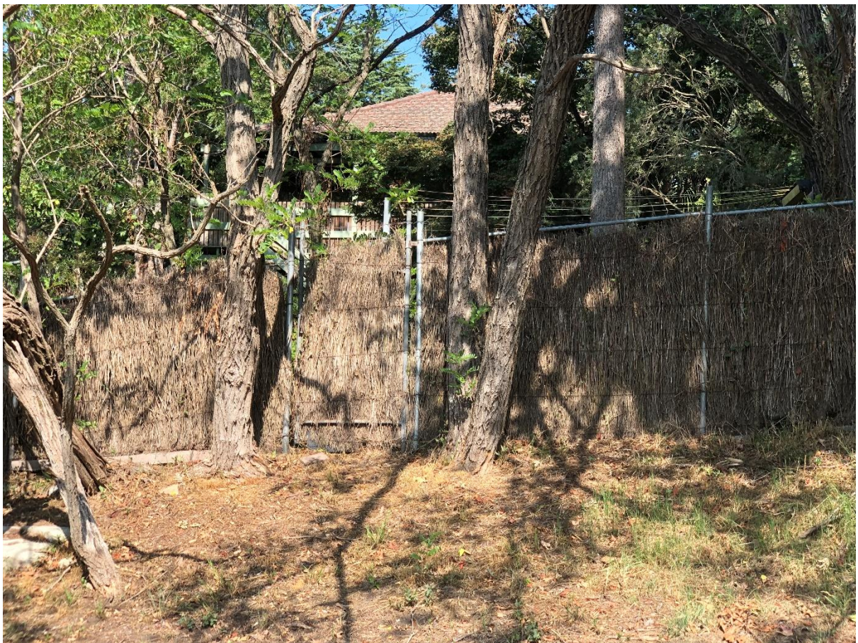
Photo 16 – View to eastern boundary (rear yard No 19 Colwell Crescent)