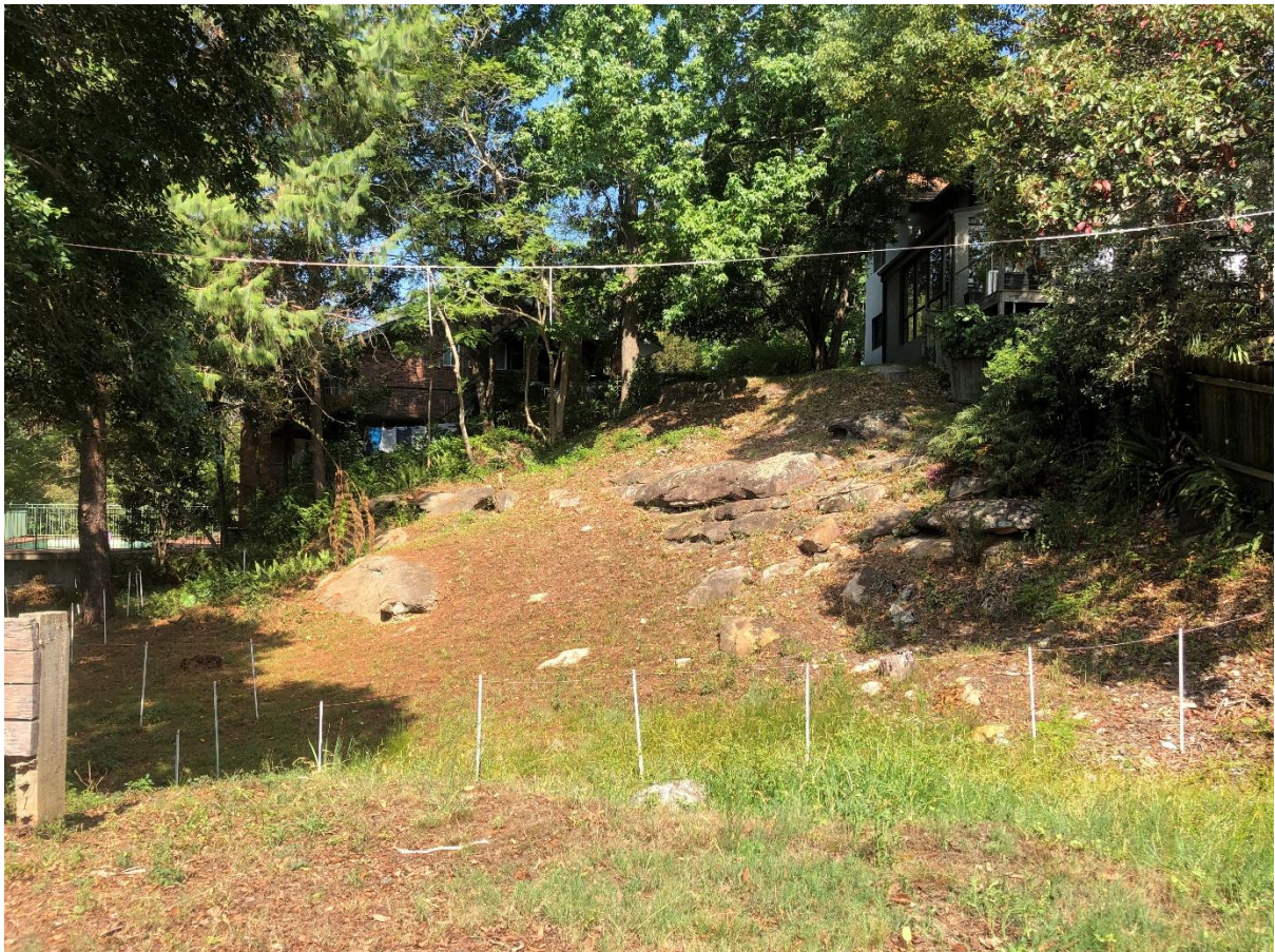
Photo 14 – View from northern end of site looking east to No 15G Colwell Crescent