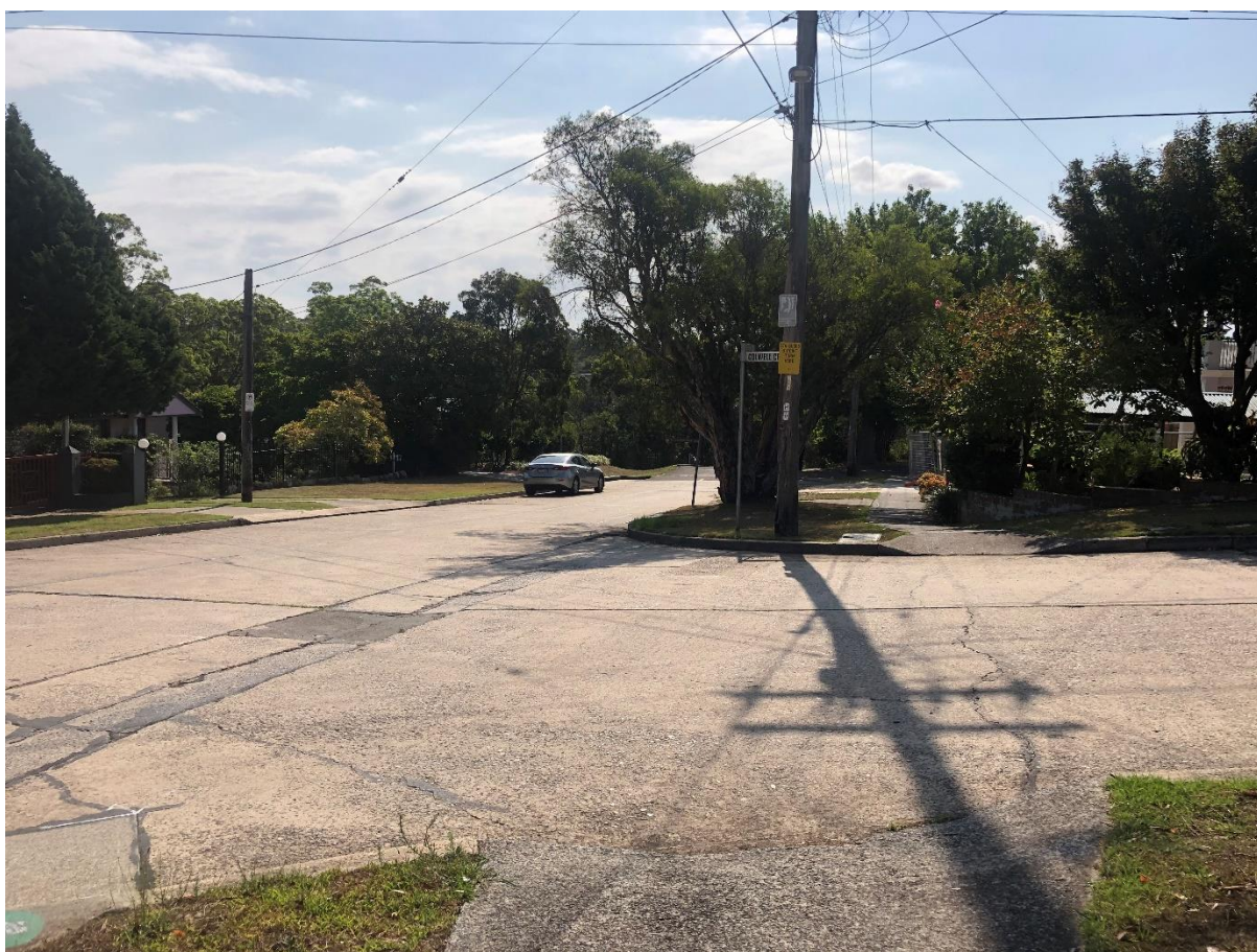
Photo 29 – Pathway to Beaconsfield Road (bus stop) – looking west to site entry