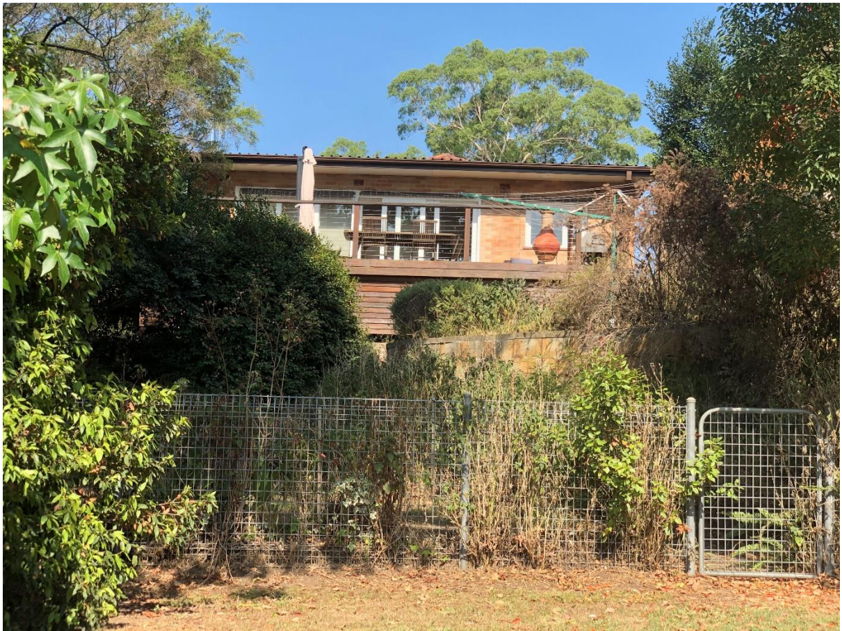
Photo 17 – View to eastern boundary (rear yard No 21 Colwell Crescent)