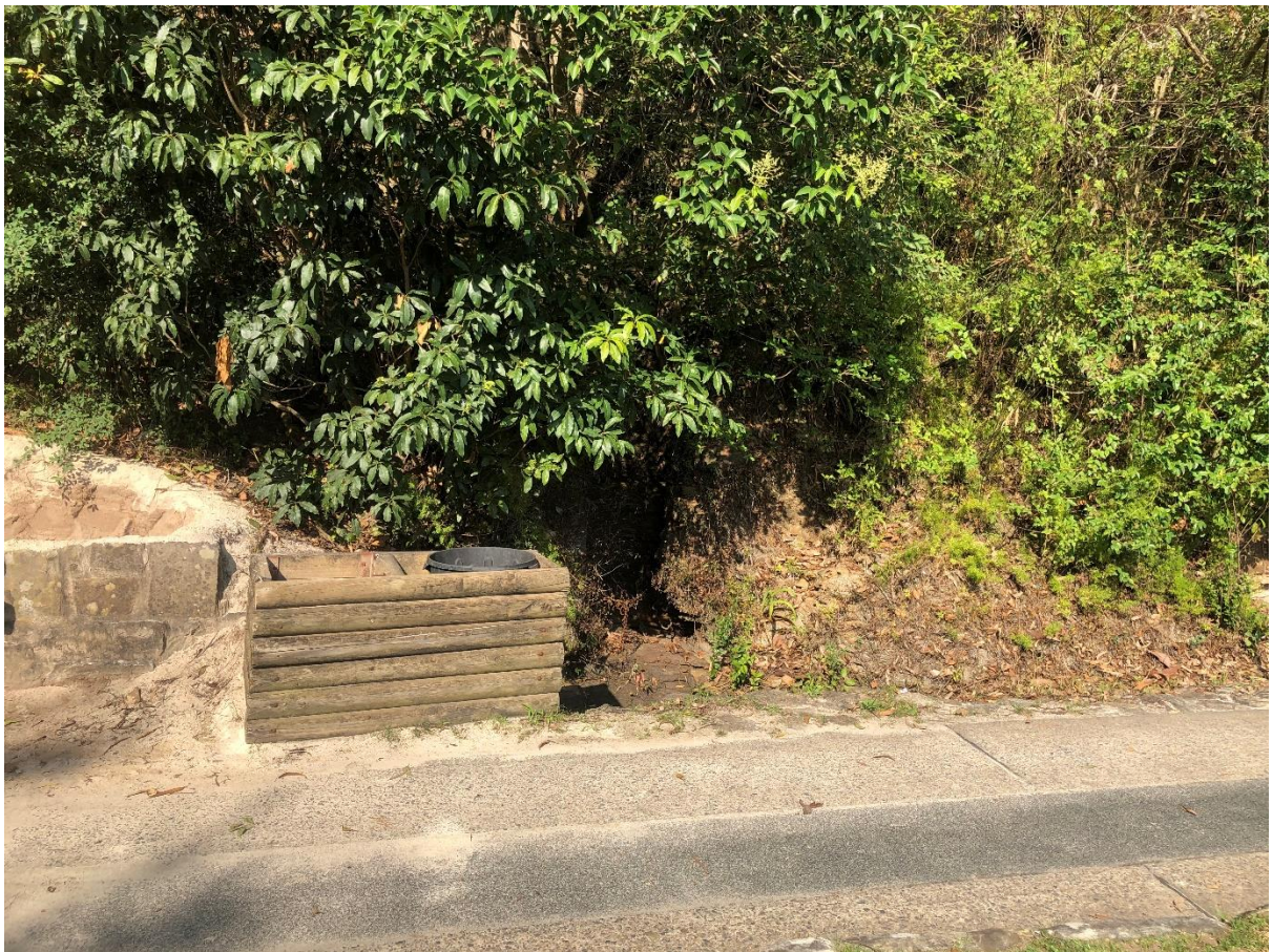
Photo 37 – View of southern end of development site drainage outlet below E4 parcel