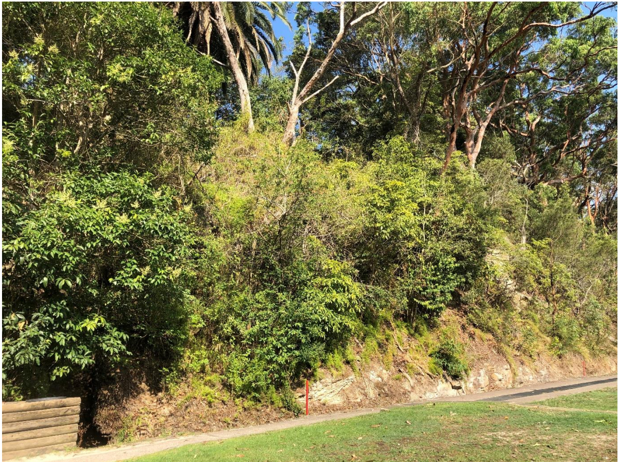
Photo 39 – Area to the south-east of E4 parcel abutting golf course fairway (proposed APZ)