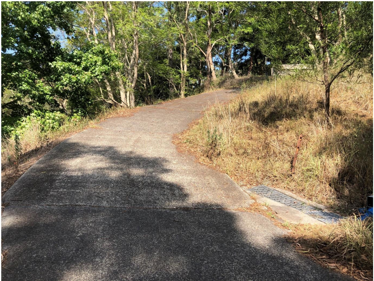
Photo 12 – View looking up driveway towards No 15G Colwell property