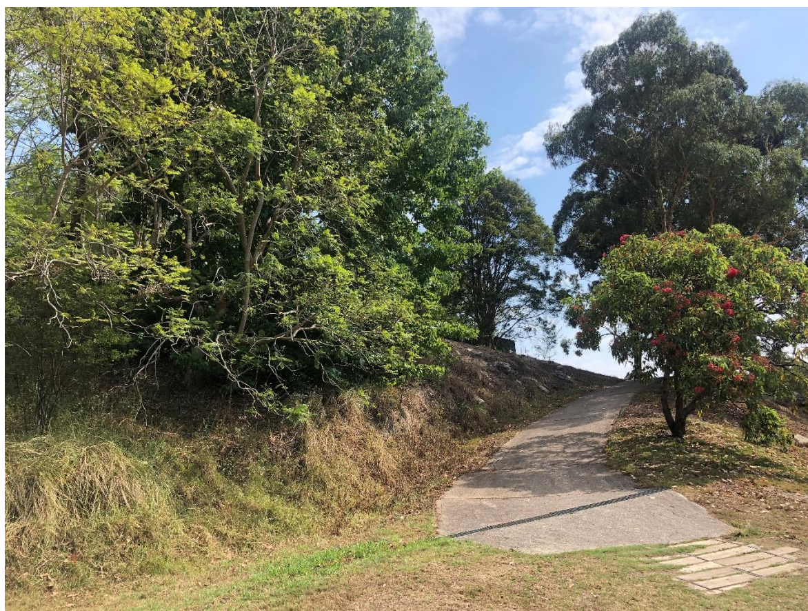
Photo 9 – View from fairway looking up (northern) driveway link to carpark