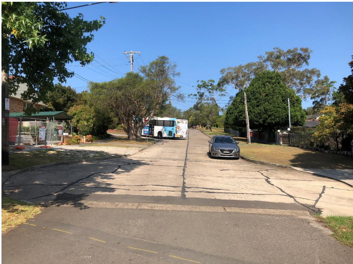
Photo 27 – View from site entry looking east to Beaconsfield Road (bus turning at Colwell Crescent)