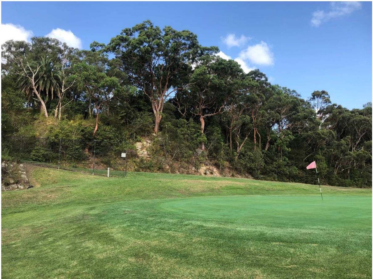
Photo 48 – view from fairway looking north to proposed APZ (south of development site)