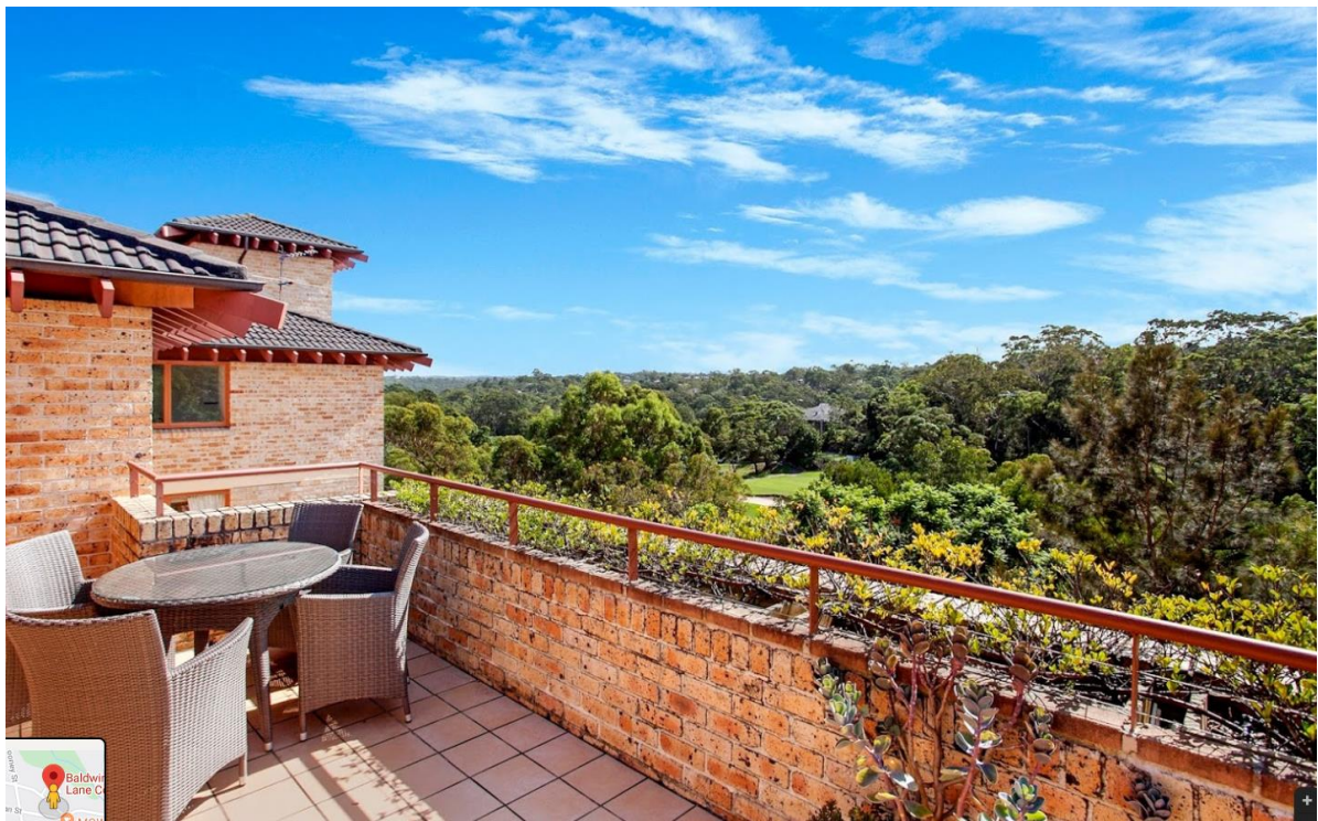
Photo 34 – View from unit terrace at “Baldwin Living” 5-9 Hart Street looking to Golf Club