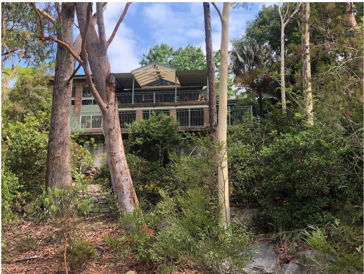
Photo 7 – View from fairway looking south to No 15G Colwell Crescent