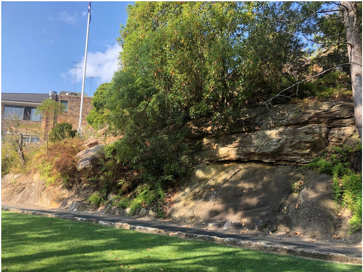
Photo 36 – View of southern end of development site (proposed APZ)