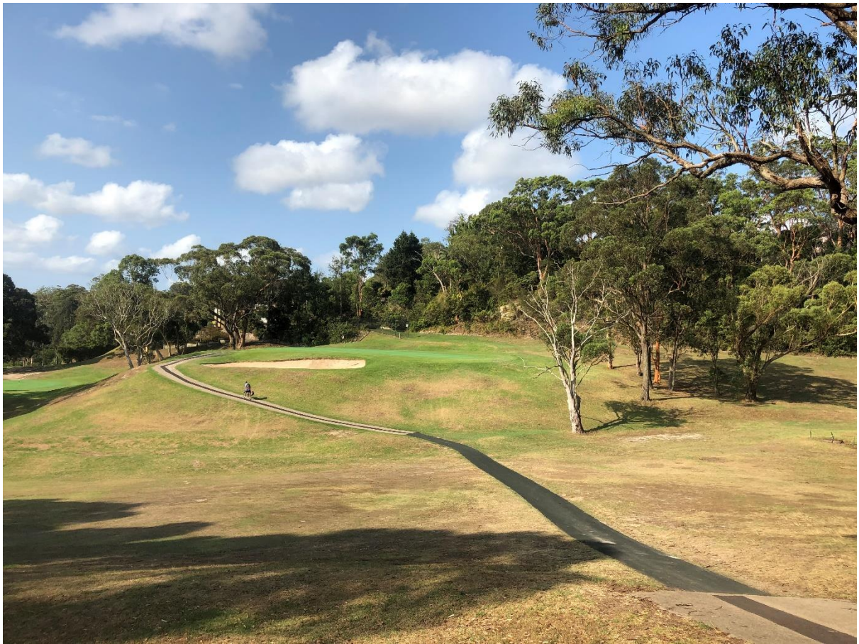
Photo 42 – View across golf course taken from south side of fairway