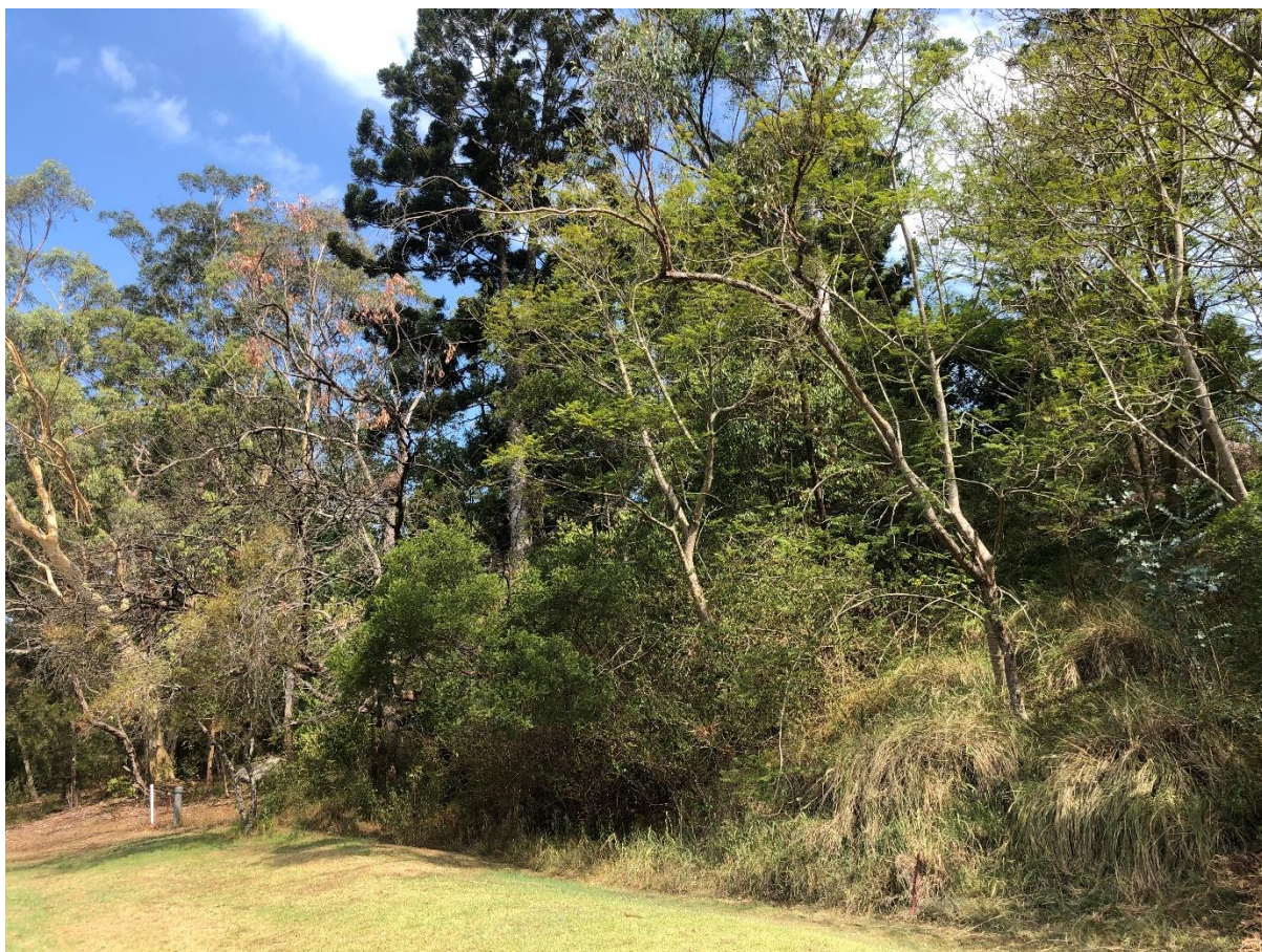
Photo 8 – View from fairway looking south to vegetation (part northern APZ)