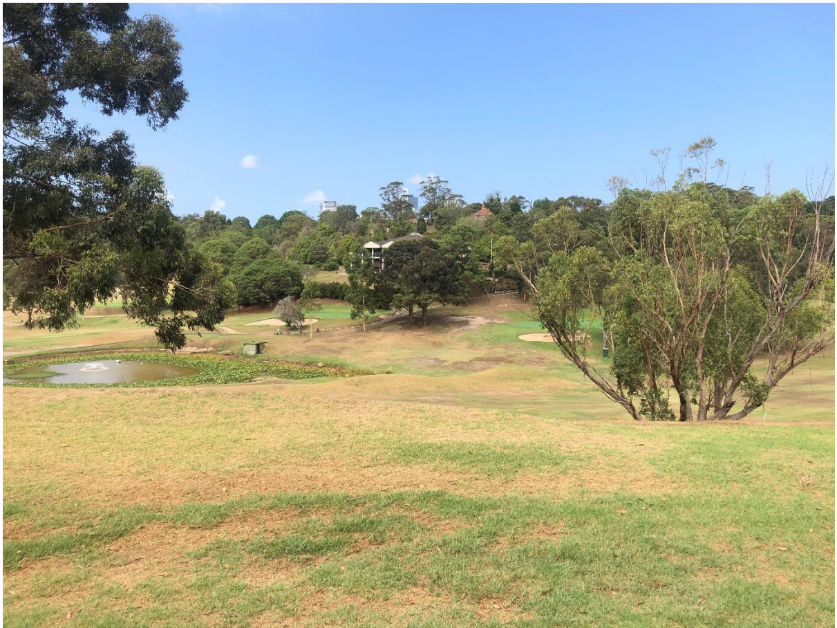
Photo 1 – View from fairway looking east to Clubhouse and subject site