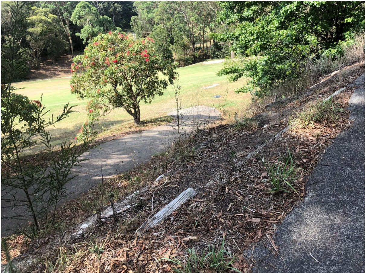
Photo 11 – View looking north from driveway with inlet drainage pit at bottom