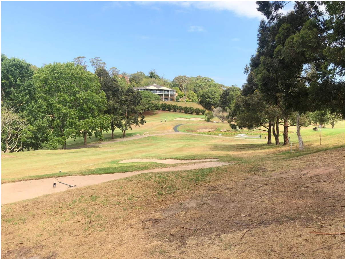
Photo 4 – View from mid-way across fairway looking south-east to Clubhouse site