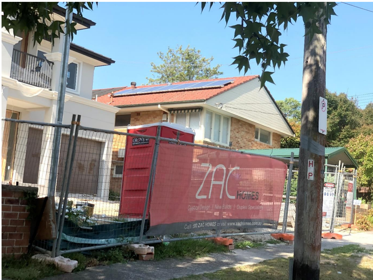
Photo 26 – No 123 Beaconsfield Road under construction 13-1-2020