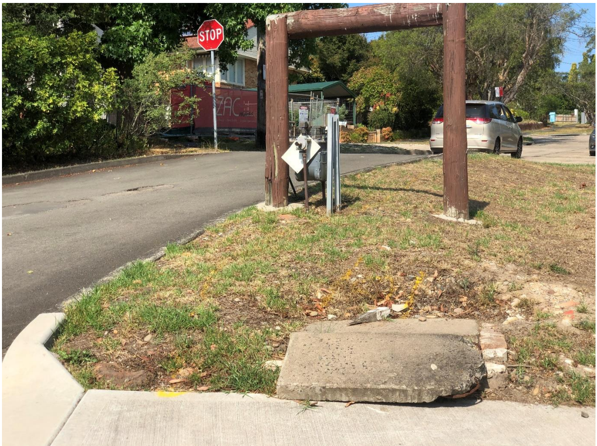
Photo 25 – View from E4 zoned parcel (& drainage pit) looking east to Beaconsfield Road cul-de-sac