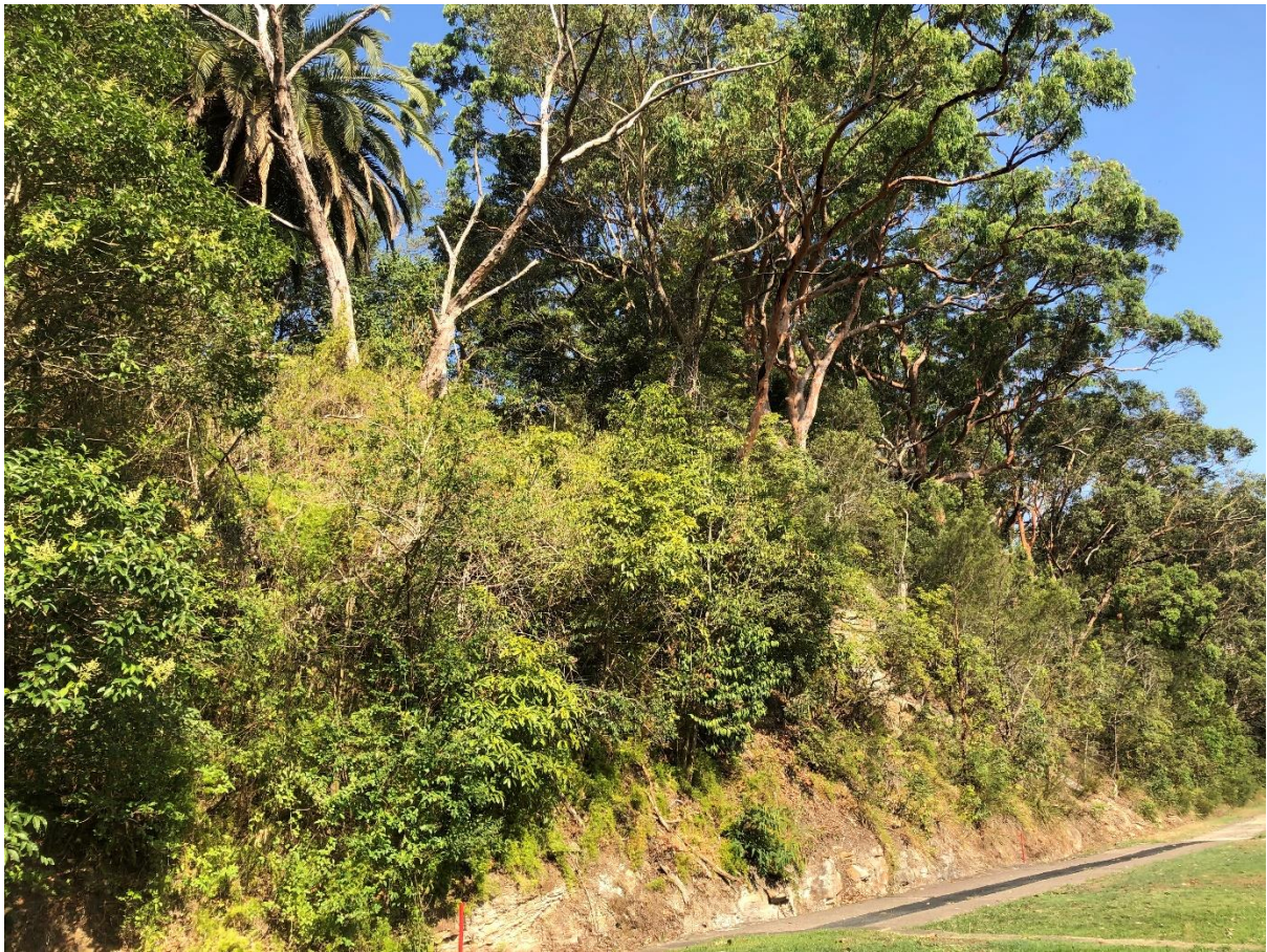
Photo 40 – Area to the south-east of E4 parcel abutting golf course fairway (proposed APZ)