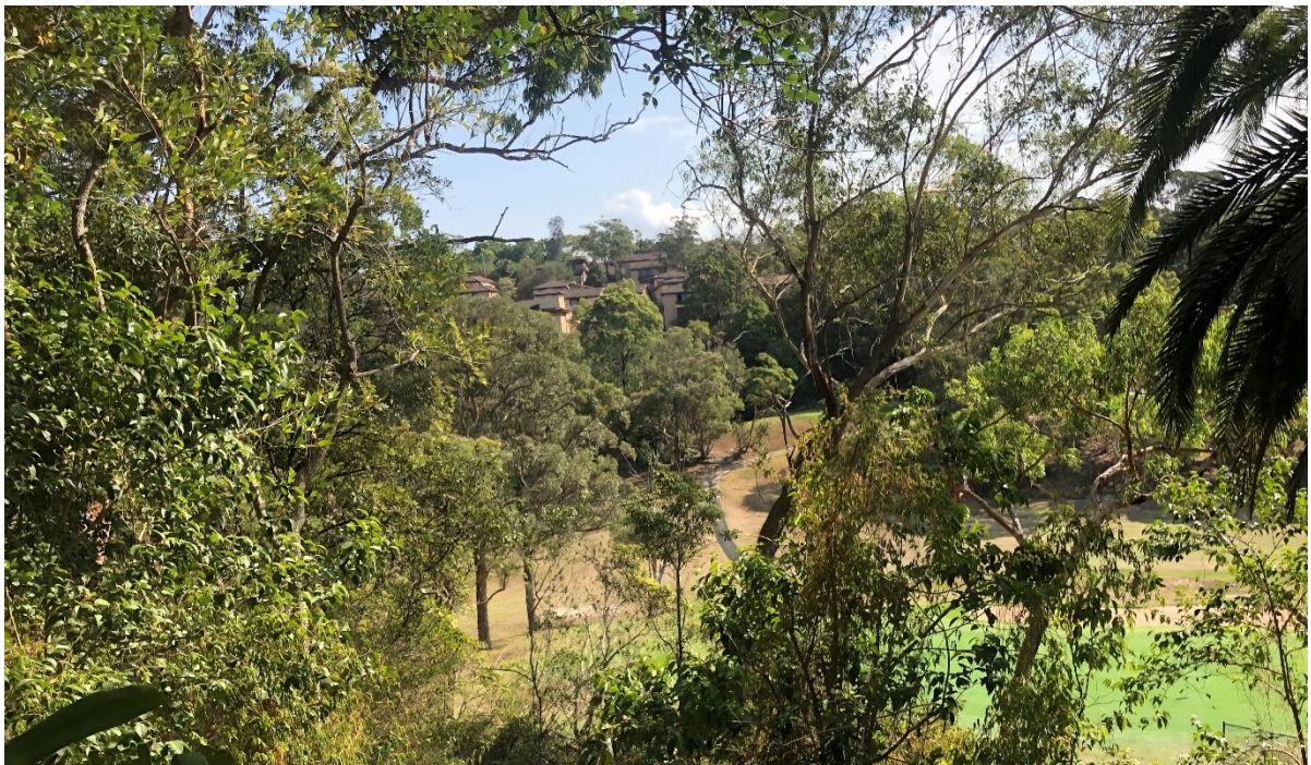
Photo 33 – View from E4 parcel to retirement village “Baldwin Living” 5-9 Hart Street located on southern side of golf course