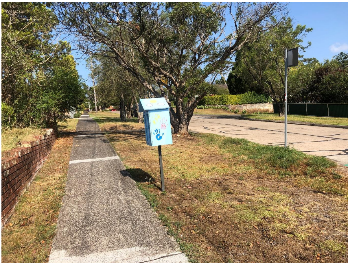
Photo 28 – Pathway to Beaconsfield Road (bus stop) – northern side of road.