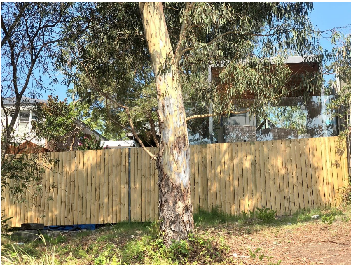
Photo 19 – View to eastern boundary (rear yard No 25 Colwell Crescent)