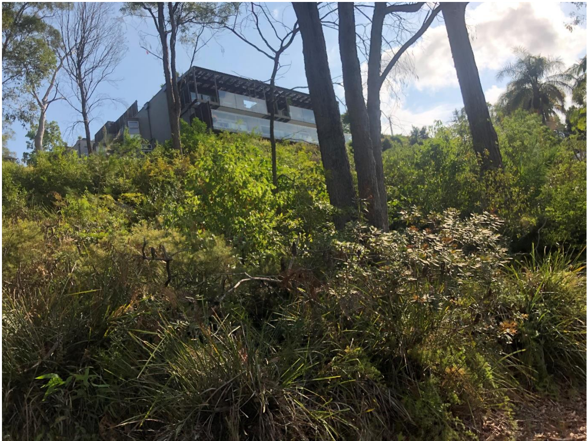
Photo 44 – Units overlooking south side of fairway No 13 Hart Street viewed from fairway